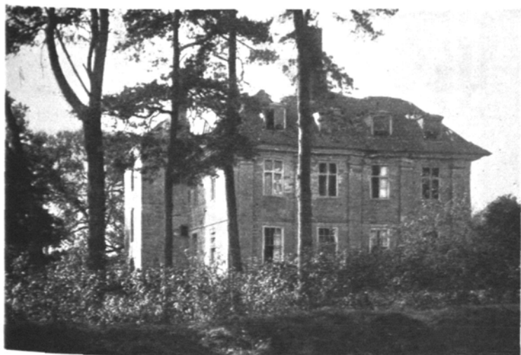
Remains of the North Front in 1908.