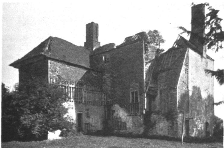
Back of the House in 1908, from the South-East.